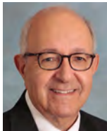
Hon. Ignazio J. Ruvolo (Ret. Court of Appeal, First Appellate District) JAMS