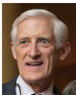
Hon. Wynne S. Carvill Superior Court of Alameda County